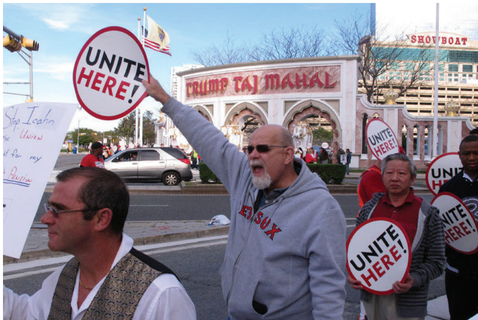
Union members picketing outside the Trump Taj Mahal casino in Atlantic City, N.J.

They're least prevalent in the South and places with right-to-work laws. See how your state compares.